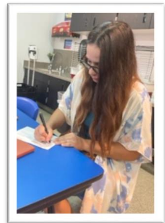
Kylie's observations and reflective questions for Kylie